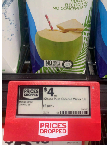
Image 7: Photo taken on 6 December 2023 at Woolworths Marrickville Metro

This 'Prices dropped' label (image 7) created confusion for respondents, with 19% saying the product was discounted, 58% believing it wasn't and 23% unsure. This is despite no previous higher price or discount amount being listed on the label. 38% said they were not able to quickly and easily know if the product was discounted, 49% said that they were able to and 13% were unsure.