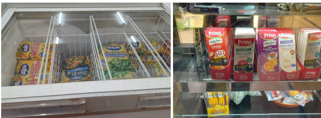
Image 3 (left): Unpriced frozen vegetables. Image 4 (right): Unpriced packaged cracker and meat products. Images captured at Yirrkala Community Store in June 2024.

Yirrkala Community Store is the only provider of food and groceries in the community and is one of the locations where a financial counsellor we spoke to reported inconsistencies in how pricing information is communicated. Some labels could be found across the store, but there were many cases where no price was provided, for both healthy and unhealthy products (images 3 & 4).