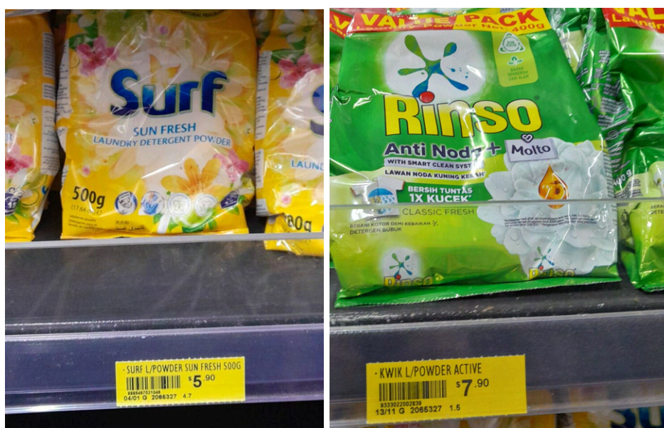
Images 5 and 6: Two images of different brands of washing powder that do not display unit pricing - Captured at Yirrkala Community Store in June 2024.

Even in stores where unit pricing is displayed, there are a number of inconsistencies across and within stores. Different font sizes and types are used, which can make it difficult for consumers to notice and read. The Unit Pricing Code does not currently outline how a unit price should be presented, so the code should include a specific and prescriptive mandatory labelling standard outlined in detail for all retailers to ensure unit pricing is not left open to interpretation and subsequently difficult to enforce.