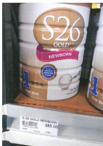
Image 1: Photo taken of baby formula found in a community store in Far North QLD

The high prices, and limited availability, of healthy food are a contributing factor in poorer health outcomes for First Nations peoples in remote communities. First Nations peoples living in remote areas were significantly more likely, at 21%, than those in non-remote areas, at 9%, to have diabetes according to the Australian Institute of Health and Welfare. 5 First Nations peoples aged 2 and over in remote areas were also more likely to report cardiovascular disease at 18% than those in non-remote areas at 11%. 6