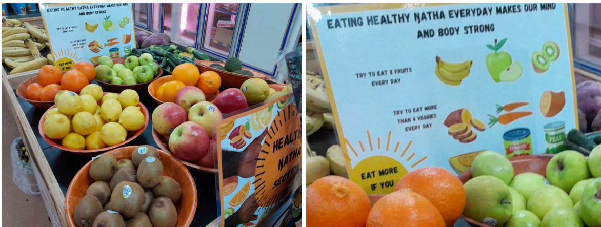
Image 2: Healthy options promoted at Yirrkala Community Store in June 2024.

A range of healthy food items isn't always available. In some stores, signs can be found encouraging the uptake of healthier fresher foods like fruit and vegetables (image 2). However, we have heard from financial counsellors that often healthy foods are the first to go once delivered to stores, and are not as easily restocked as pre-packaged or unhealthier options that have a longer shelf life. We encourage the NIAA to consider introducing a means of regularly monitoring remote stores to ensure there is sufficient quantity and quality of stock and prices.